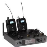
Sennheiser EW IEM G4-TWIN In-Ear Monitoring System - A1 Band