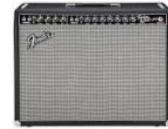
1 mic for Lead Guitar